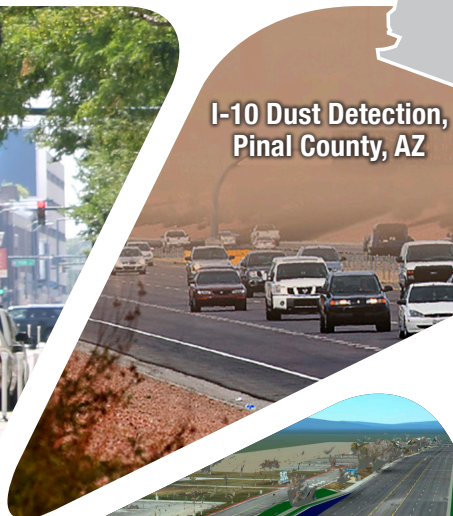
I-10 Dust Detection, Pinal County, AZ