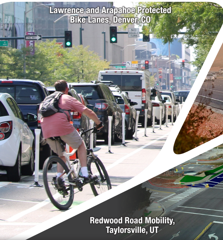
Lawrence and Arapahoe Protected Bike Lanes, Denver, CO