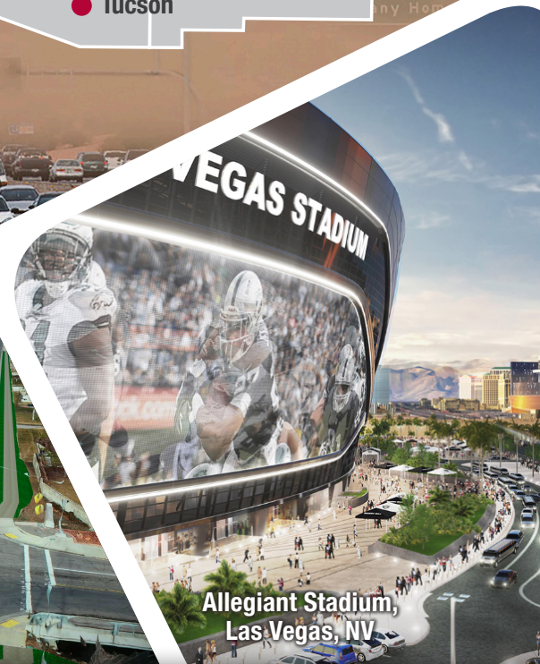
Allegiant Stadium, Las Vegas, NV